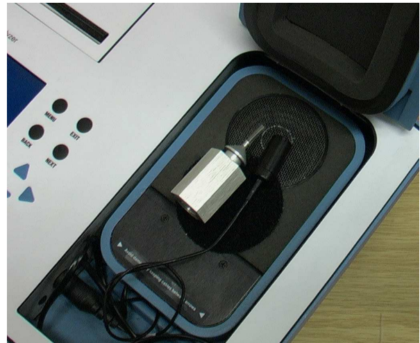
Setup for levelling

As we are measuring GAIN, not output, look at the top of the vertical graph axis on the display. If it says "SPL" (which means S ound P ressure L evel, or output) press MENU and use the vertical arrow keys to move the cursor in the menu box to "DISPLAY", then the horizontal arrow keys to toggle from SPL to GAIN. Press "MENU" or "EXIT" to exit the menu.